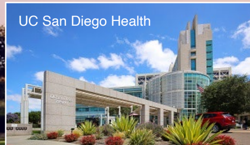
UC San Diego Health

For information on The Priest James Foundation Partnerships