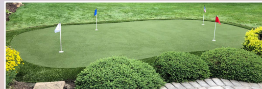
Putting Green to Be Donated to Bannister House Two additional greens will be donated to medical facilities prior to the end of 2022!