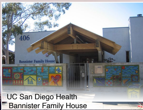
UC San Diego Health Bannister Family House