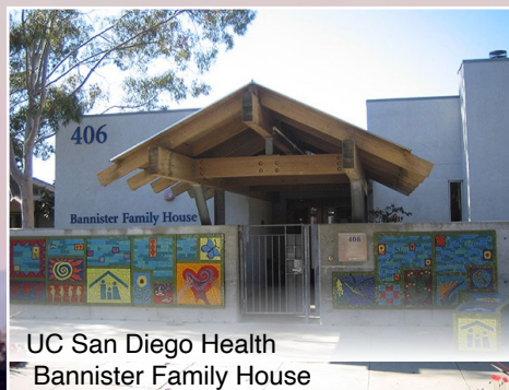
UC San Diego Health Bannister Family House