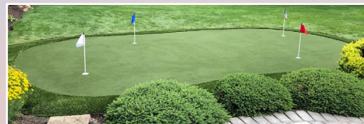
Putting Green to Be Donated to Bannister House Two additional greens will be donated to medical facilities prior to the end of 2022!