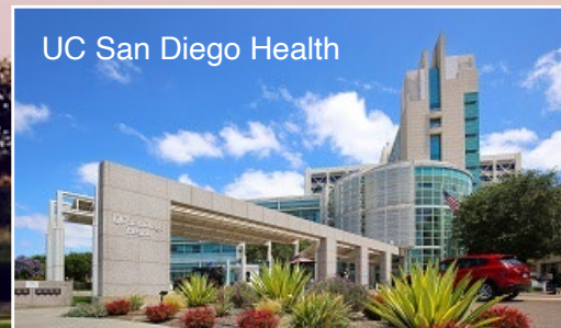
UC San Diego Health

For information on The Priest James Foundation Partnerships